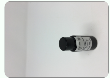
The photos on this report are of a sample collected by the lab and may vary from the final packaging.